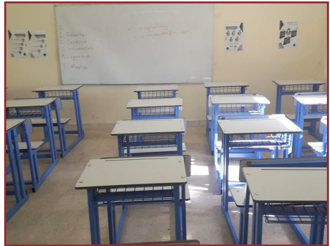
Salt Latin School

Due to the pandemic, the school desks are empty and students are not able to use the desks.