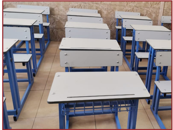
Jubeiha Latin School