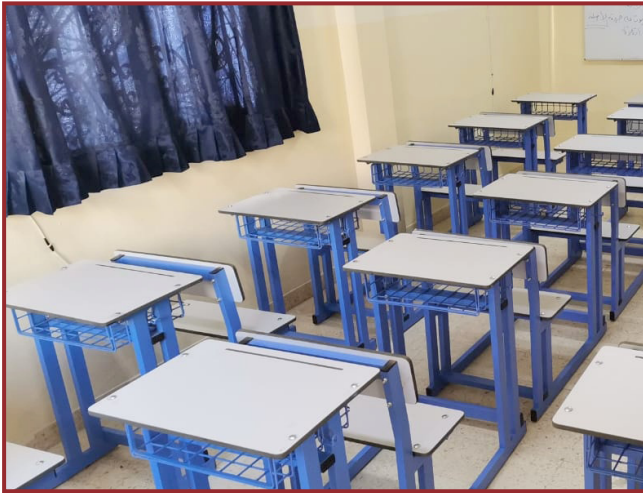
Mafrq Latin School