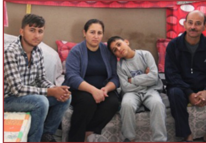
Iraqi Christian Refugee' Family, Jordan 2016

Since their arrival to Jordan in August 2014, Iraqi Christians were living in improvised church premises, halls or caravans. The Latin Patriarchate of Jerusalem has been helping them unconditionally by paying their accommodations, utilities, medical health and transportation costs. The most essential fields of support for the refugees are: first, the educational support – school fees for 1,100 students, transportation for 745 students, book fees for 1,100 students, uniform fees 1100 students, education informal 300 students, life skill trainings for 450 students. Moreover, the LPJ provided around 11,235 displaced Iraqi families with humanitarian support, such as: cash money, food, clothes, shelter, water, medicine, hospital fees, transportation, etc.