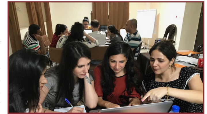
Capacity Building for the Beneficiaries of Gaza Job Creation Project, January 2020

Gaza for a specific period of time ranging from 12 to 27 months depending on funding available and contributions from the hiring institutions. The candidates were chosen after a call for applications that was launched through the Churches and the Holy Family Church's networks in Gaza focusing on the capabilities and qualifications of the youth themselves and work on providing job opportunities that matches their skills and future aspirations. This opportunity has helped the youth to gain work experiences and life skills, which will allow them to stand out to future potential employers when the program ends. Through the project, the youth received life skills training and general capacity building workshops on the jobs they are performing.