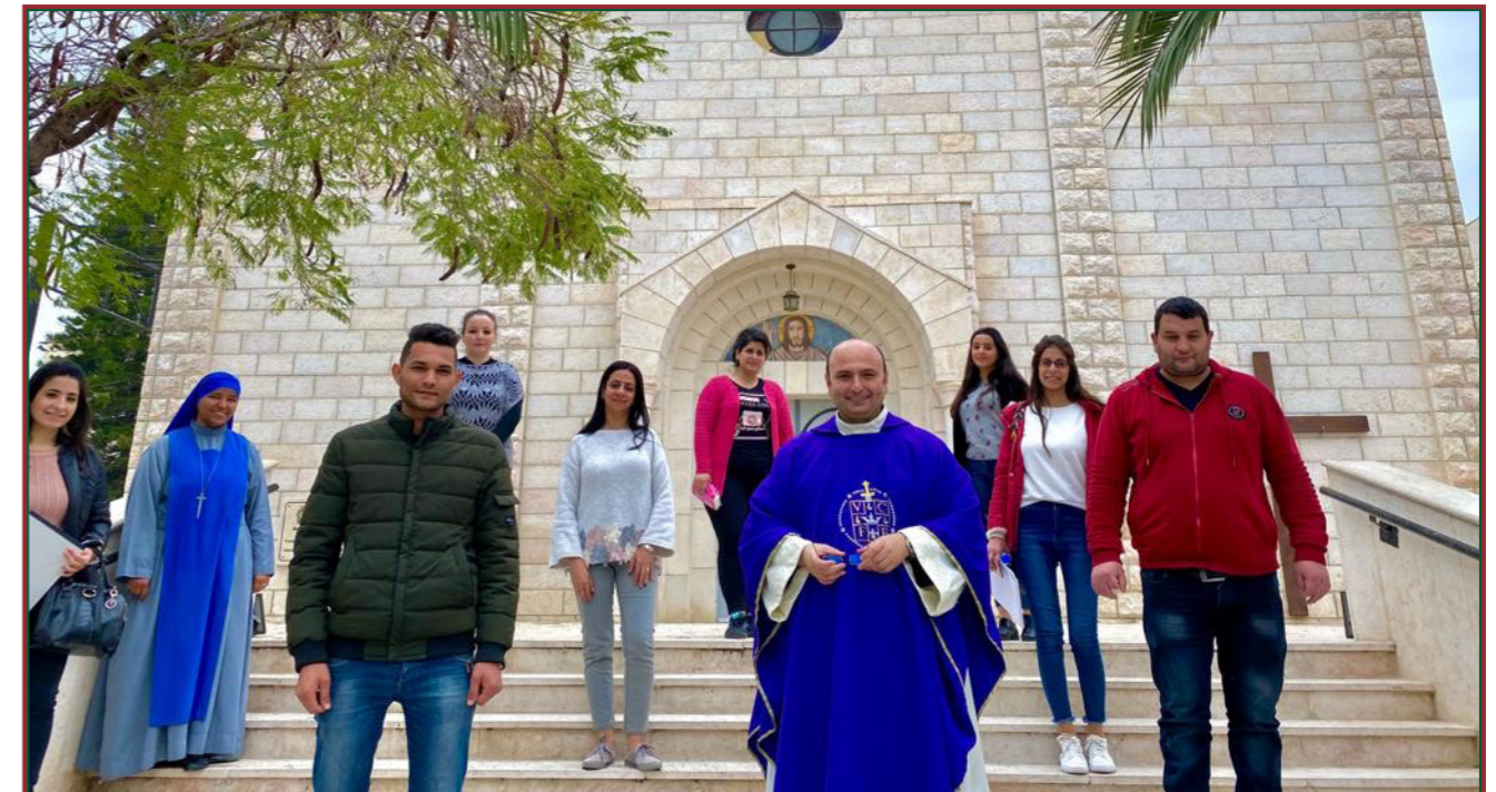
Some of the beneficiaries of the Gaza Job Creation project with the parish priest at the Latin Parish, 2020

The needs in Gaza are enormous and the youths strive to secure the basic needs of life for their children and families. They are seeking employment opportunities to escape the clutches of poverty by all means available. They are enduring exceptional economic, political circumstances and discrimination on the basis of religion that makes them fail to find employment opportunities in the local market. The Latin Patriarchate aims to provide assistance to all of them and give them a chance to gain money in a dignified manner and improve their skills by expanding the program in the near future.